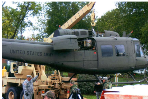
Memorial Huey picture 2.jpg (878x580)