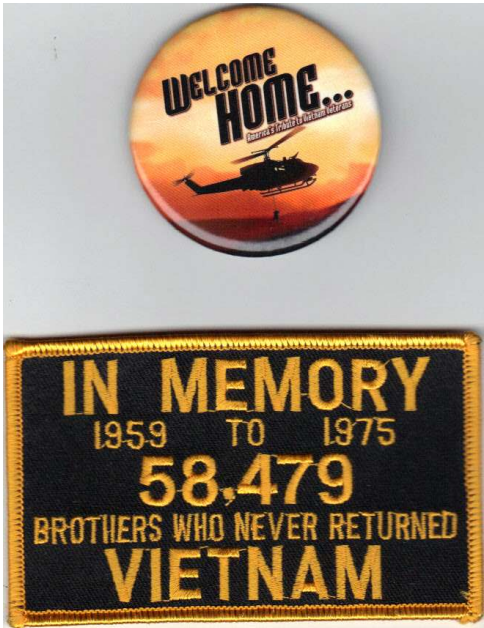
Vietnam Memorial Buttons and Patches. JPG (656x857)