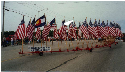
Branson Veterans Day Flags Display, One for every State.JPG (1047x593)