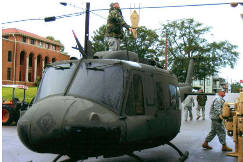
Memorial Huey picture 1.JPG (878x574)